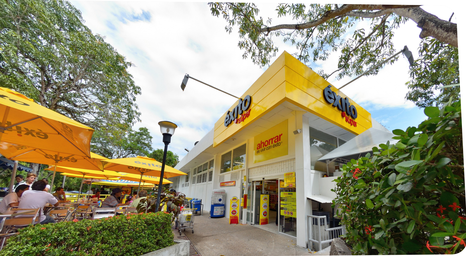
Éxito Melgar store in Tolima, converted from Cafam

For the third quarter and nine-month period ended September 30, 2011